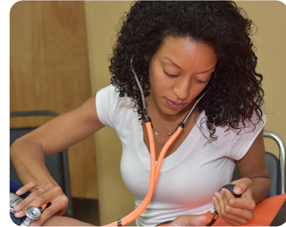
Local LINKS screenings